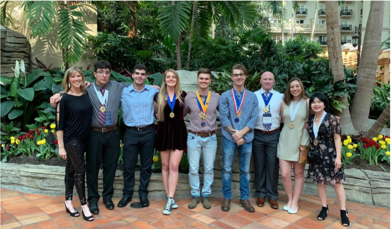
Palomar College chapter at Phi Theta Kappa Catalyst Convention April 2019